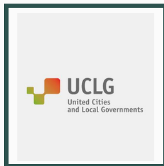
United Cities and Local Governments